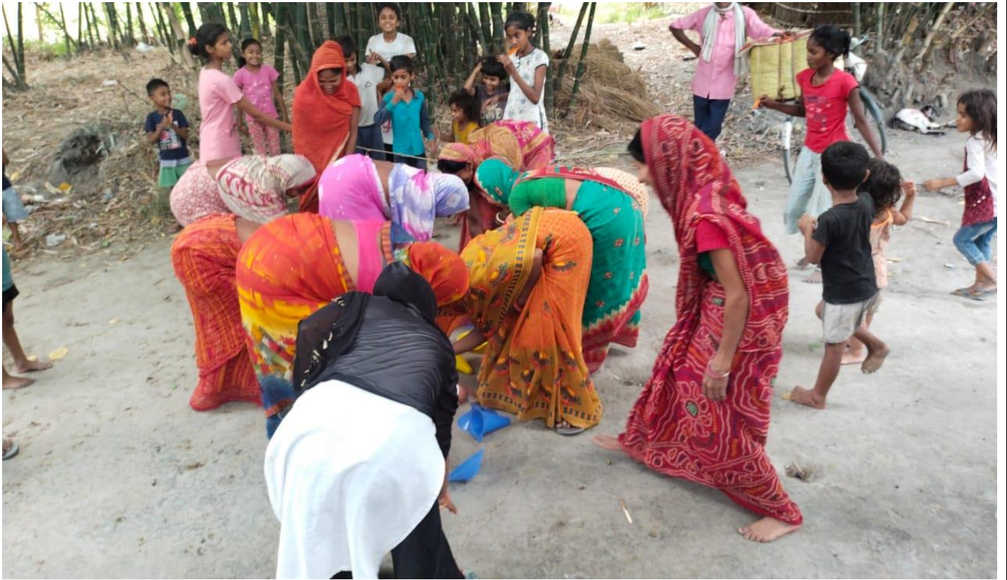
Builder & Bulldozer with Community Female Members