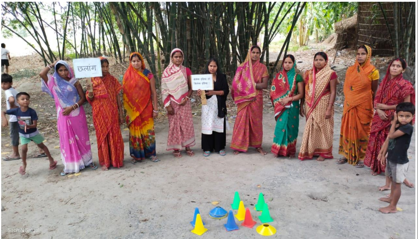
Activity With Community Members