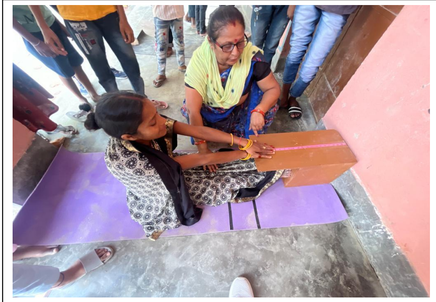
Seat & reach

During the community summer camp 2023, we have done the Swasth Community Assessment of so many guardians and villagers